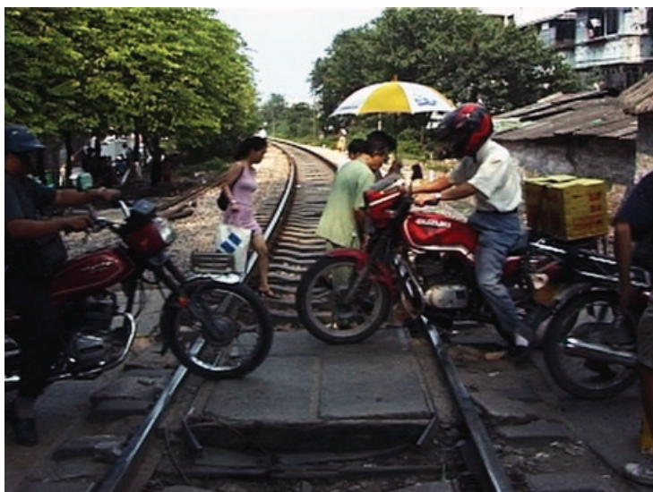
La traversée du rail (installation, 2014) © Robert Cahen