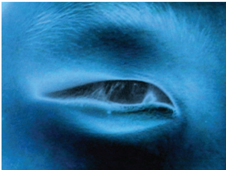
Sept visions fugitives (video, 1995) © Robert Cahen